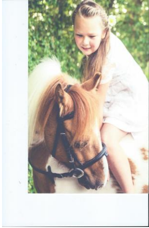
Benefits from building a relationship with a pony

Spending time around horses is now clinically proven to be beneficial to your health. Horses have a calming influence and can be therapeutic to us all, helping confidence and self - awareness, or for a relaxing break from routine. You don't need to ride to feel the benefits of being around horses.