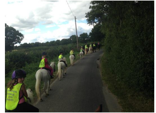
Trekking to the local pub for refreshments